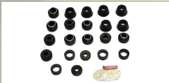
87-96 JEEP WRANGLER - BLACK