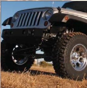
07-12 JK JEEP WRANGLER 4.5" LIFT