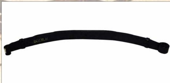
76-86 JEEP CJ FRONT LEAF SPRING