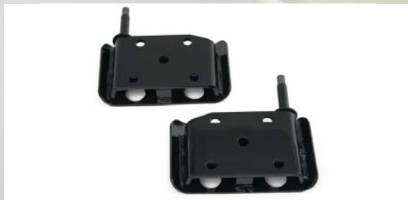
72-75 CJ5, CJ6 FRONT UBOLT SKID PLATE