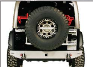
97-06 WRANGLER TJ SWING AWAY TIRE CARRIER