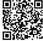
07-12 WRANGLER JK SWING AWAY TIRE/CAN CARRIER