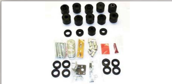
97-06 JEEP WRANGLER BODY BUSHING KIT