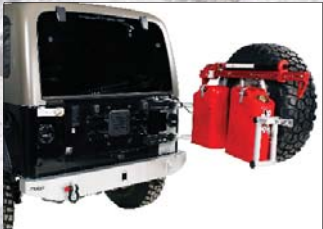
97-06 WRANGLER TJ SWING AWAY TIRE/CAN CARRIER