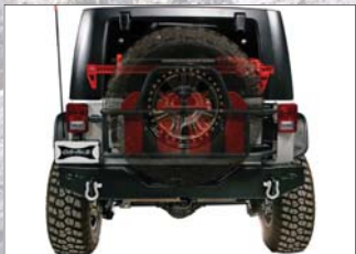
07-12 WRANGLER JK SWING AWAY TIRE/ROTOPIX™ CAN CARRIER