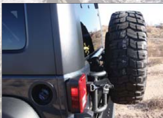
07-12 WRANGLER JK SWING AWAY TIRE CARRIER